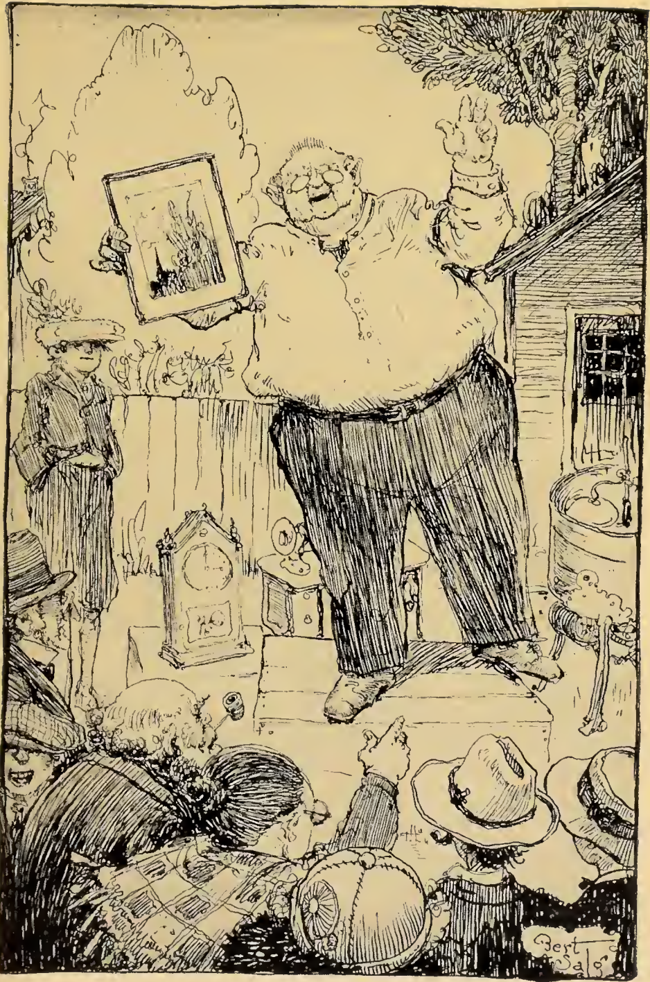
LAWYER FUZZER BECOMES AN AUCTIONEER.